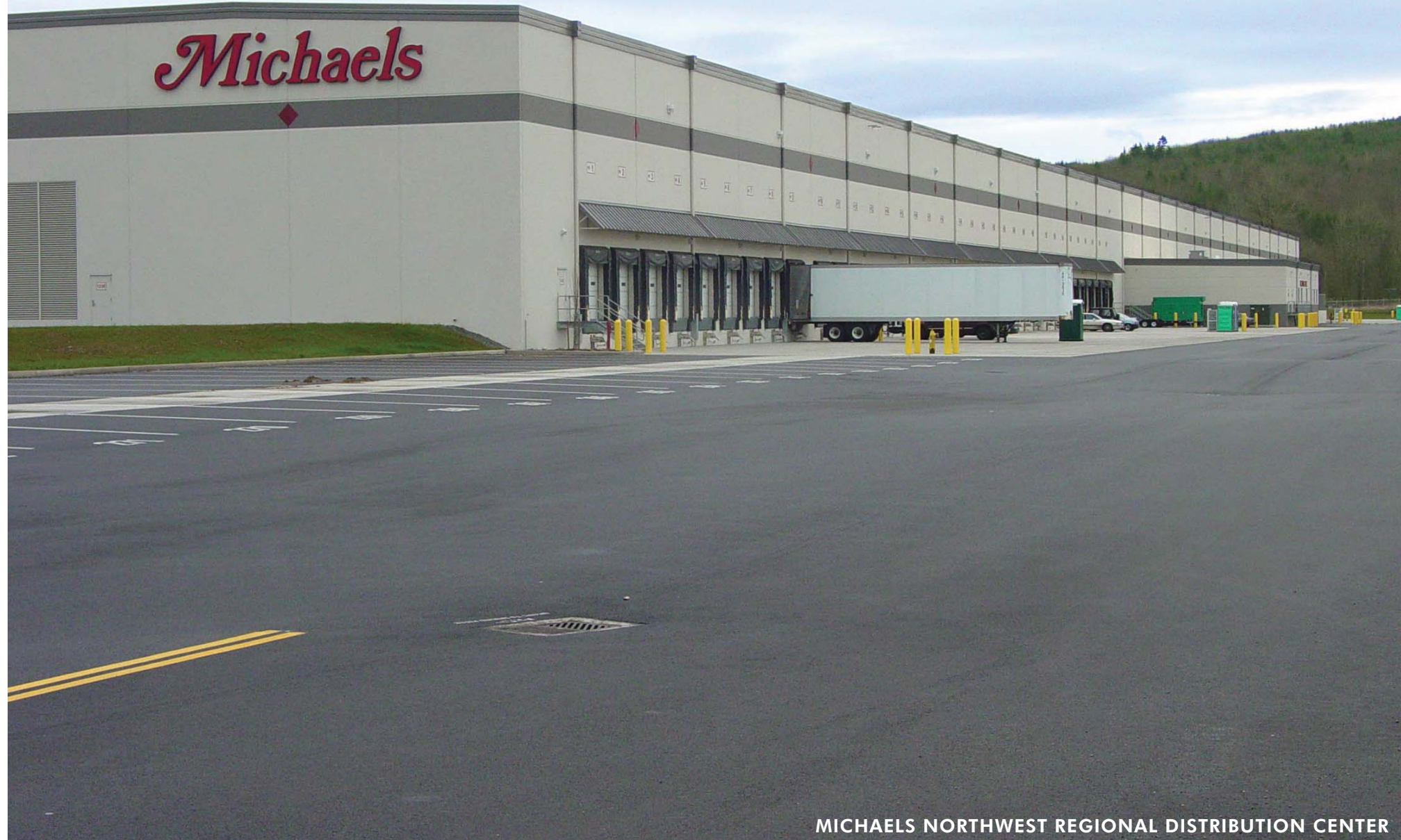
MICHAELS NORTHWEST REGIONAL DISTRIBUTION CENTER