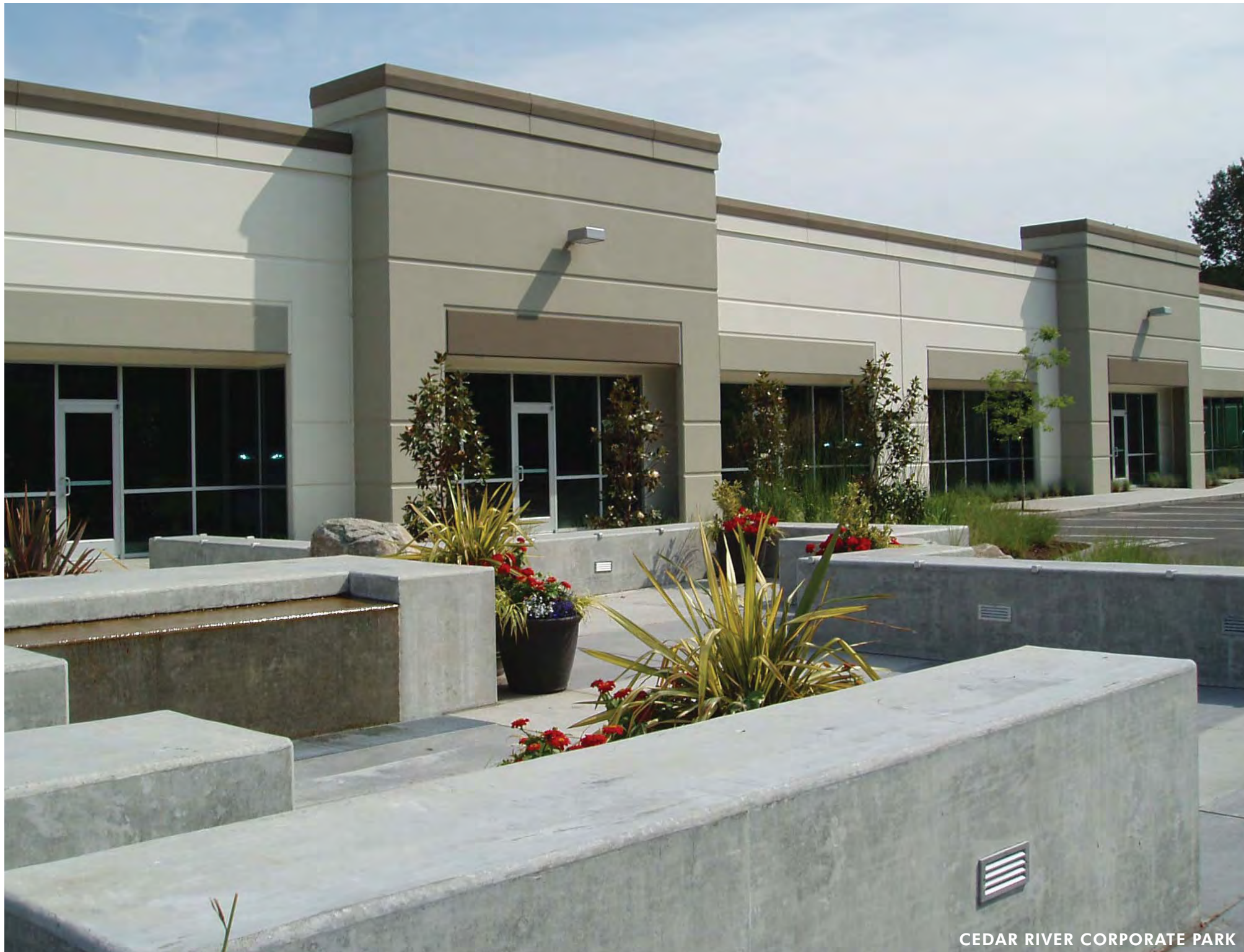
CEDAR RIVER CORPORATE PARK