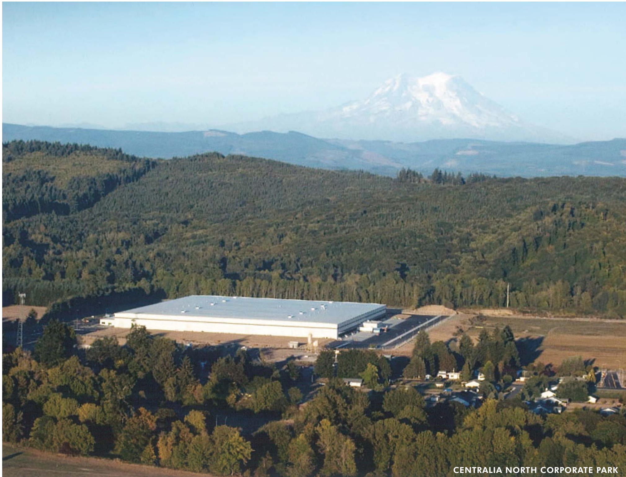
CENTRALIA NORTH CORPORATE PARK